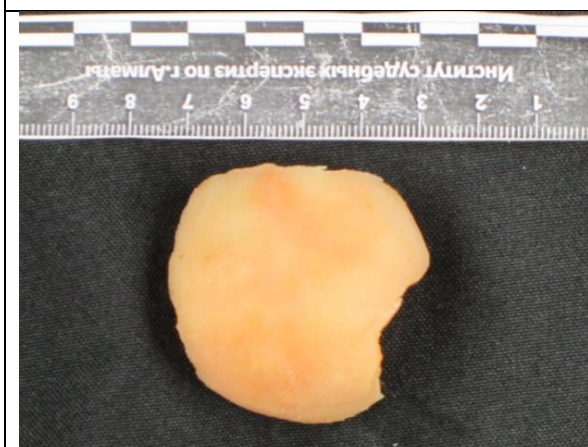
Figure 3 - Skin flap after recovery