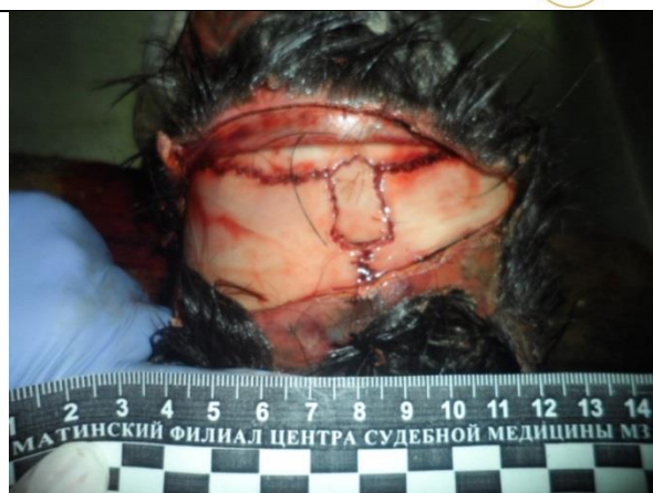
Figure 2 - View of the bones of the cranial vault during exhumation