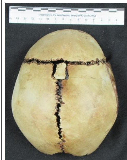
Figure 5 - Skull bones, outside view