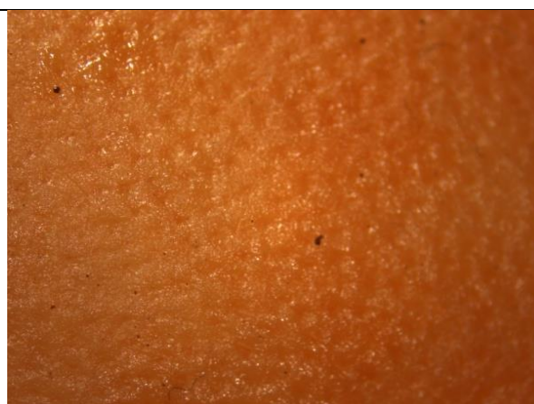
Figure 4 - Stereomicroscopic picture of a skin flap