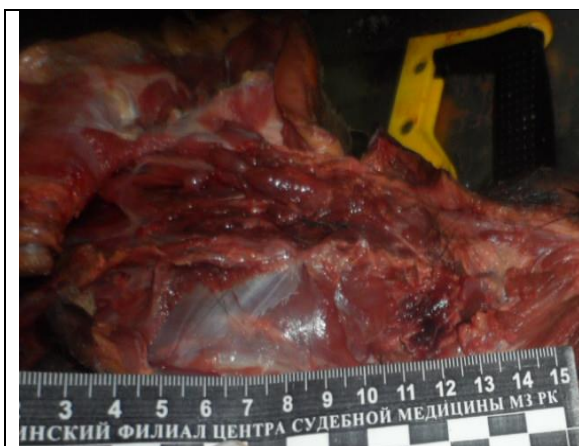
Figure 1 - Hemorrhage into the skin of the occipital region, detected during a forensic examination of a corpse